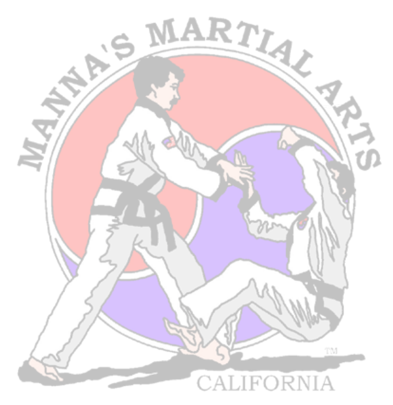
Manna's utilizes an amazing support staff of exceptional people.